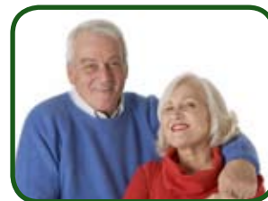
Later retirement looms