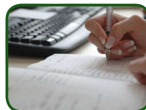
Self-certification to end